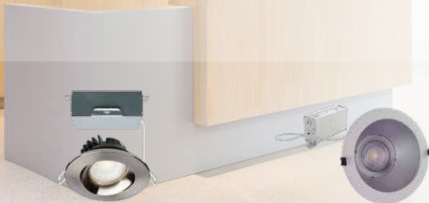
LED ARCHITECTURAL DOWNLIGHT