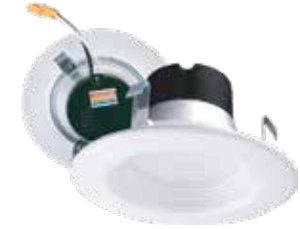
COLOR SELECTABLE DOWNLIGHTING

From color selectable commercial recessed downlights to remote driver, ultra-thin edge-lit LED recessed down lights that you can sneak into just about any narrow space.