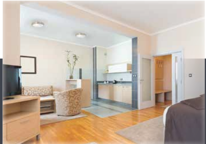
EN SUITE KITCHEN