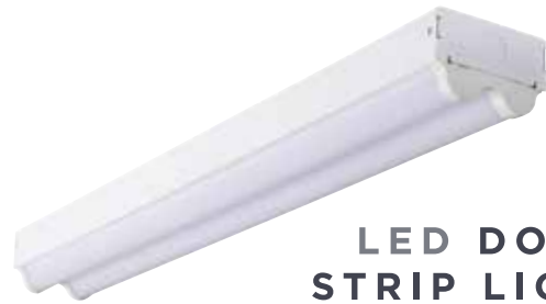
LED DOUBLE STRIP LIGHTING