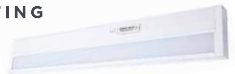
COUNTERQUICK® UNDER CABINET LED LIGHTING