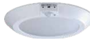
LED DISC LIGHT WITH SENSOR