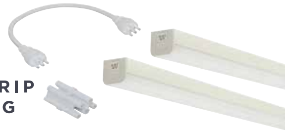
LED WIDE & SLIM STRIP LIGHTING