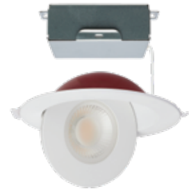
LED FIRE-RATED DIRECTIONAL